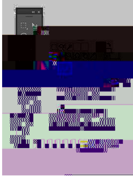
Figure 2: Comparison of Adobe Photoshop toolbar (left) with SAI PaintTool toolbar (right)

In the Adobe Photoshop toolbar, core tools are shown, sectioned off by the type of utility they offered. If a tool is clicked and held, a few options for variations of those tools are offered. For example, if the erase button is clicked and held, the user will be able to access different types of erase, such as the Background Eraser tool and the Magic Eraser Tool. In the SAI Paint Tool toolbar, tools are separated between select tools, manipulation of canvas view, and editing tools. The editing tools section has empty slots which allows users to create their own custom tools. These custom tools are basically the default tools with certain changed settings that are saved and renamed to a new tool.