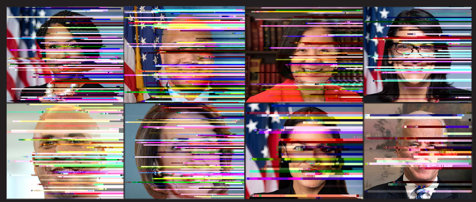
Monday, October 28, 2019 • 5:30 - 7pm • Fulton Hall 511