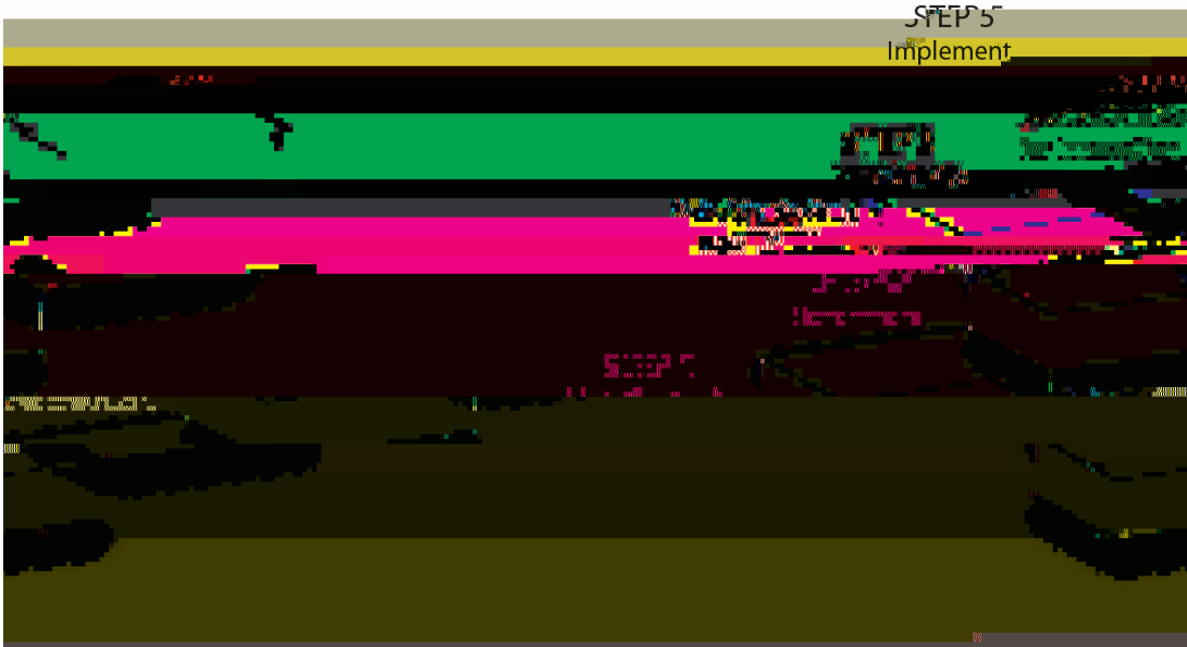
Figure 7: Step 3 of the Supervision and Mentoring System Toolkit