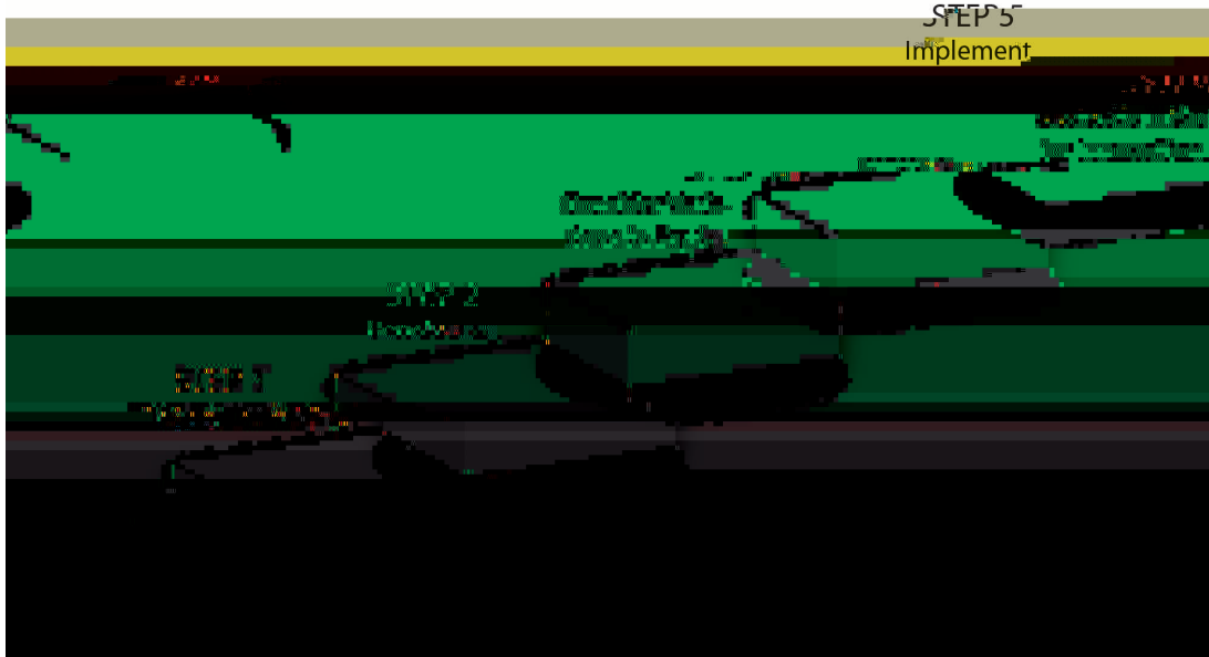
Figure 4: Step 1 of the Recruitment and Hiring System Toolkit

Step 1 engages your organization in an audit to assess the equity of your Recruitment and Hiring System.