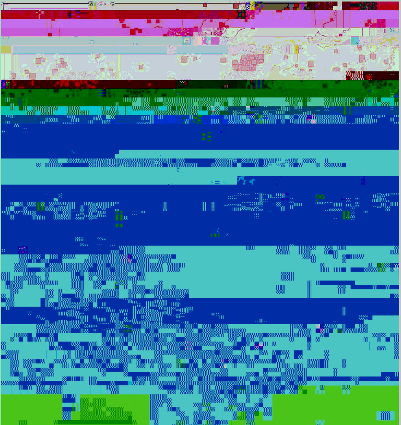
Figure 4: Seismicity for period October, 1975 - December, 2007.