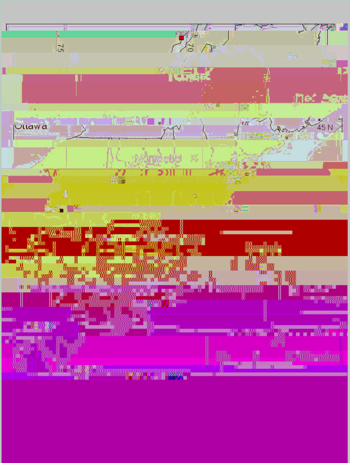
Figure 3: Earthquake epicenters located by the NESN during the period of this report.