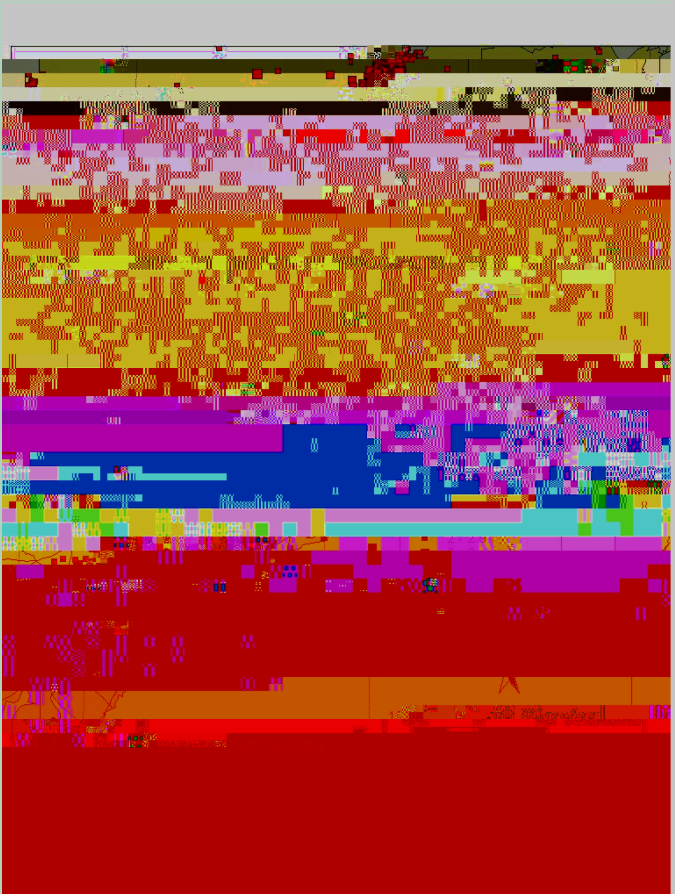
Figure 4: Seismicity for period October, 1975 - December, 2006.