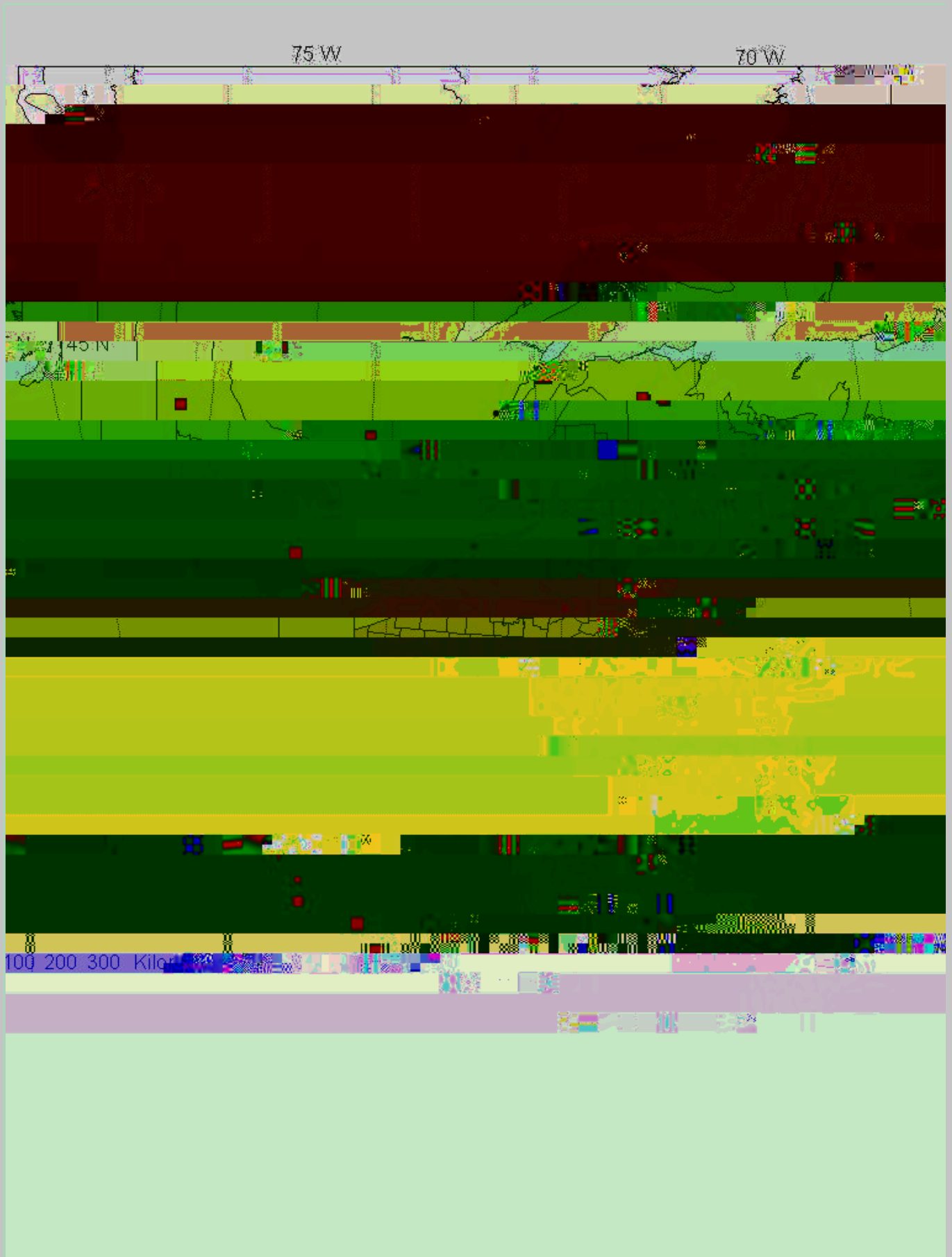
Figure 3: Earthquake epicenters located by the NESN during the period of this report.