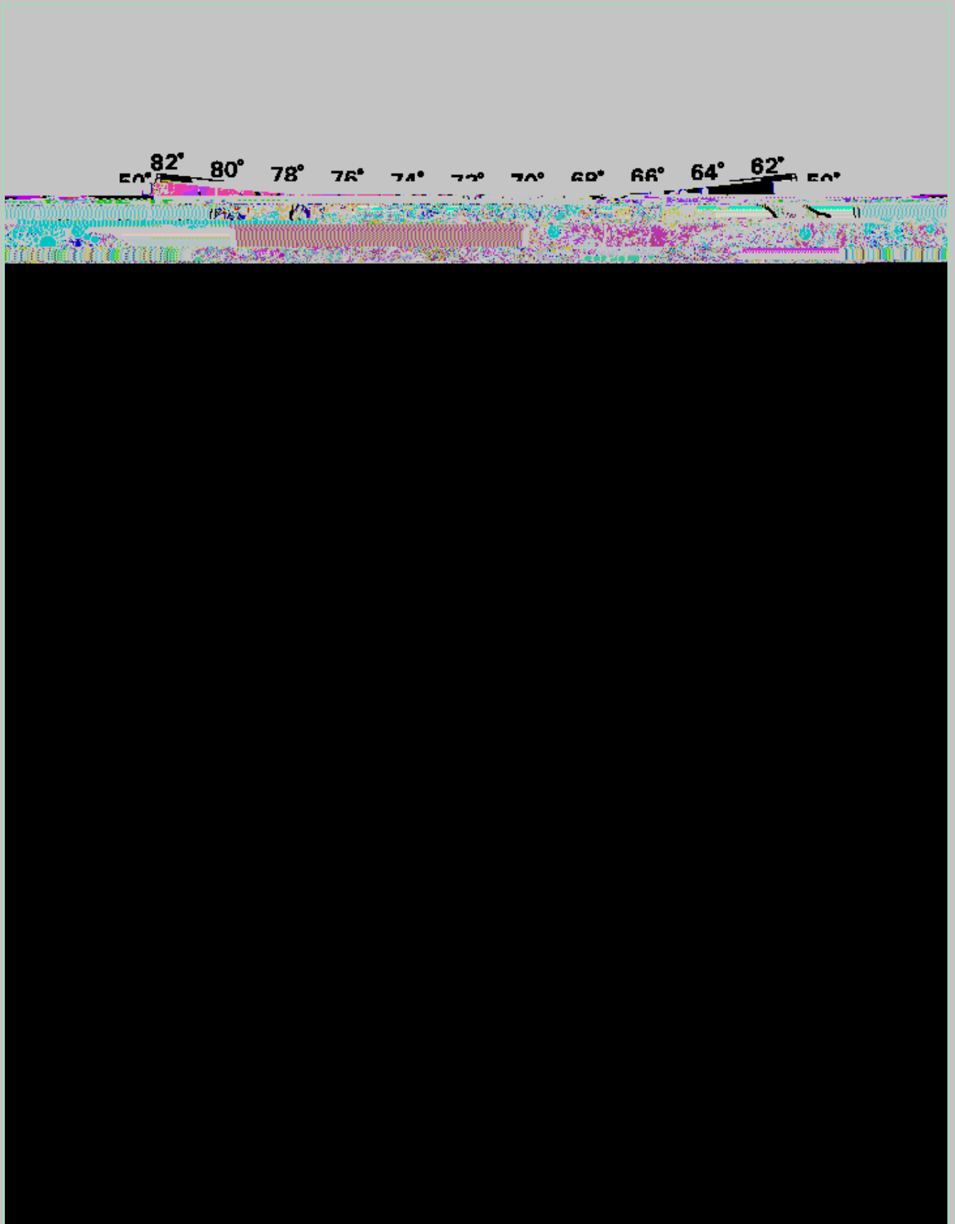
Figure 4: Seismicity for period October, 1975U