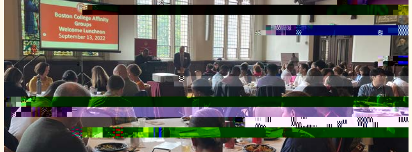
The 2022 Affinity Groups Welcome Luncheon